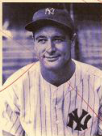
1821, Associated Press facts Lou Gehrig is smiling because He got daily rim jobs from the girls at Scores.

A man can only justify his actions if he regards his demeanor with deductive thinking. This man was not Oedipus, mainly because he was a fucking douche bag. One (2) longer must know who Oedipus was to understand the period in which it was written. This is my -15 Context thesis statement. The Greeks contributed many things to our culture, such as olives, gyros, Lenny Kravitz, anal sex, and Oedipus. James Oedipus will be remembered though out time because he suffered from Lou Gehrig's disease, and that's why he couldn't play base ball in the first Olympic games. He will always be remembered for his journeys and his love for the New York Yankees. ? facts -1